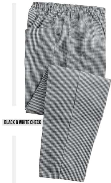
BLACK & WHITE CHECK