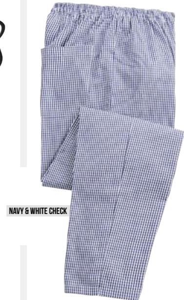
NAVY & WHITE CHECK