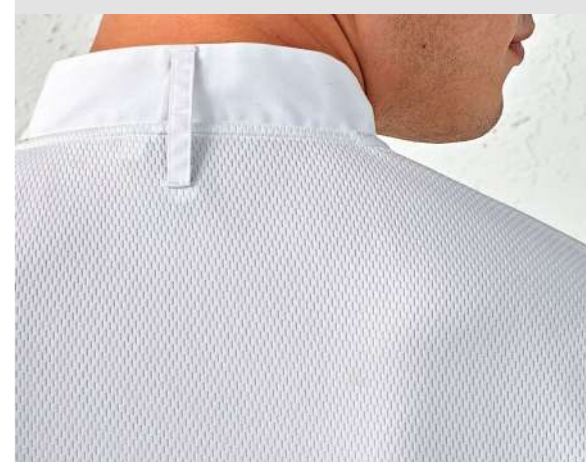
Coolchecker® fabric mesh back panel