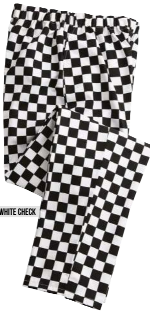
BLACK & WHITE CHECK

PR554 Chef's 'Select' Slim Leg Trousers ■ Fitted style on lower leg, Patch pocket on right leg, Elasticated waist with draw cord and zip fly fastening ■ 65% Polyester, 35% Cotton, 195gsm ■ Sizes: XS/28" – 2XL/44" ■ 1 colour